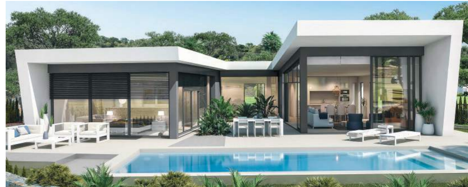
The computer-created image above is shown for illustrative purposes only and as such is not binding. The final design may be subject to changes.

The residential offering on sale at Las Colinas Golf & Country Club includes villas and apartments.